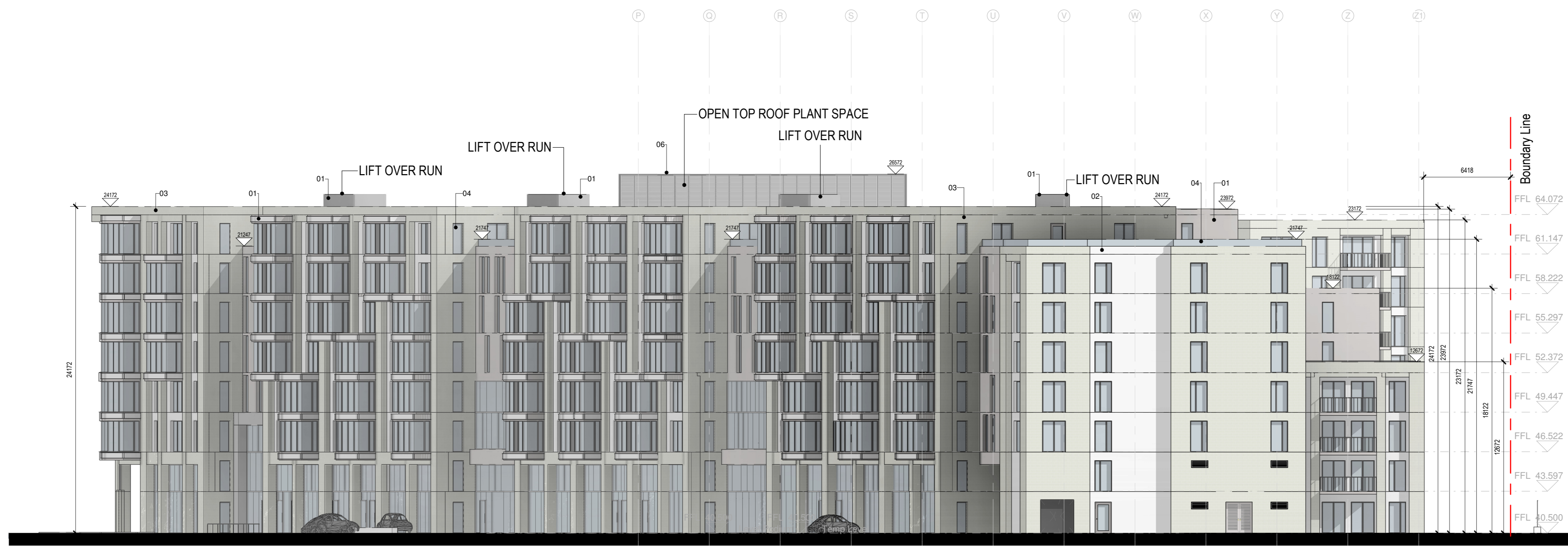
4 Elevation - West 1 : 200