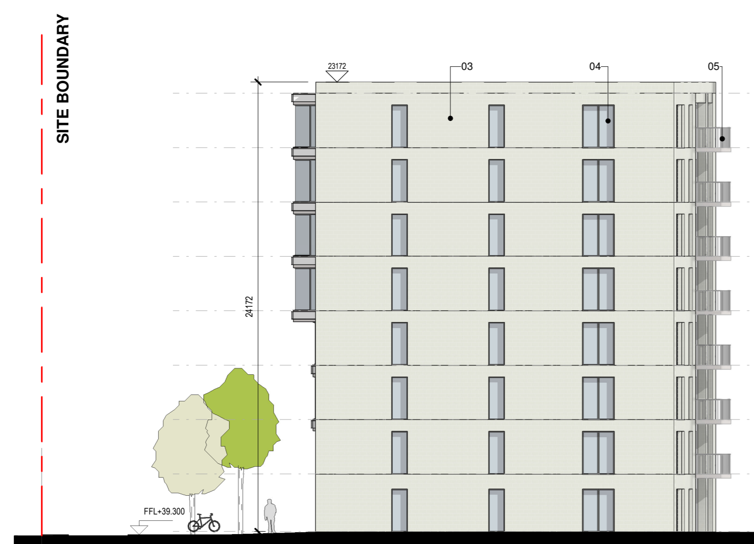
6 Elevation - North 1 : 200