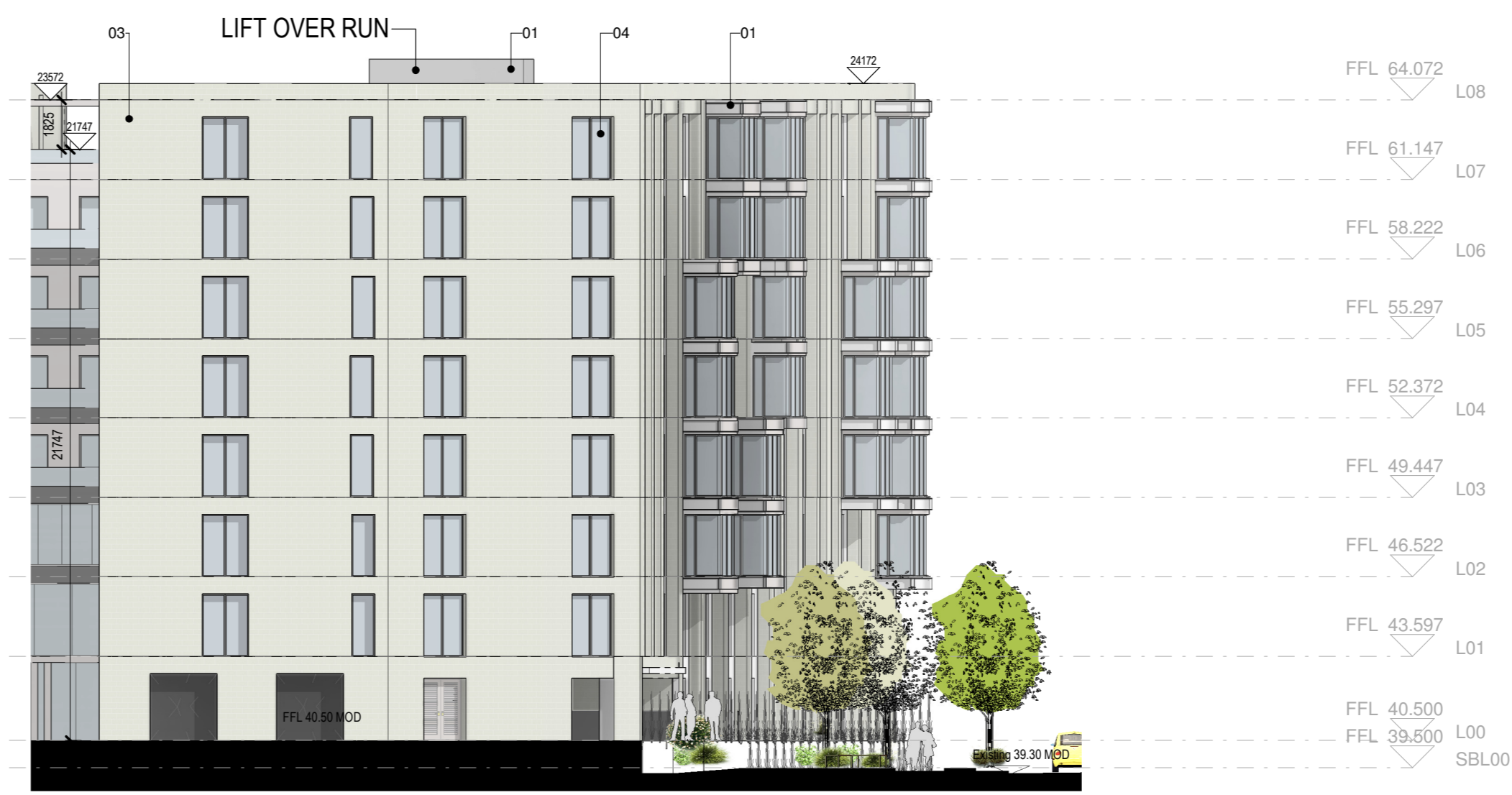
5 Elevation - South 1 : 200

P02 18/04/19 AM Issued for Planning P01 18/01/19 AB Issued for Planning